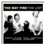
The May Fire The List self released