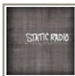
Static Radio NJ An Evening of Bad Decisions Black Numbers