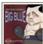
Toy Gun Cowboy Big Blue Gutter Groove