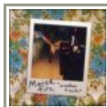
Mouse Fire Wooden Teeth Lujo