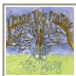
Imadethismistake It's Okay Cottage Records