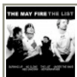
The List The May Fire